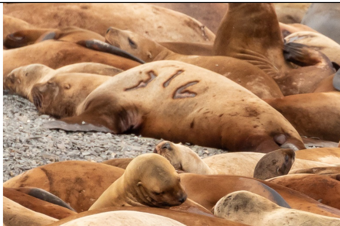
71V was photographed on September 17 by Scott Ranger at Little Island

Just like 2019 we only encountered two branded animals in 2021!